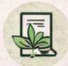
Herbarium & Museum