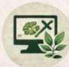
Ecology & Taxonomy Lab