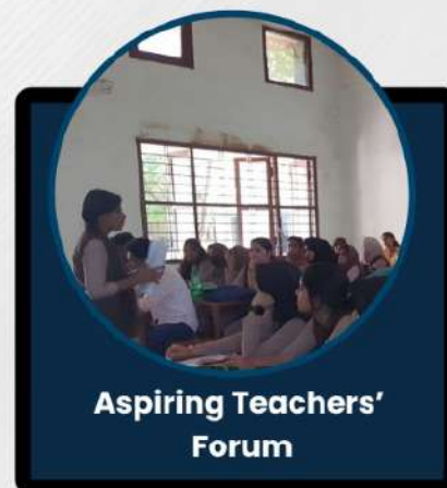
Aspiring Teachers' Forum