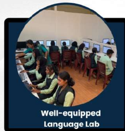
Well-equipped Language Lab