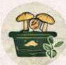
Mushroom Cultivation Centre