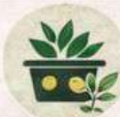
Medicinal Garden & Vermi Compost